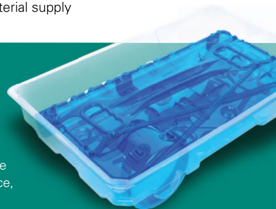
PACKAGING FOR MEDICAL DEVICES